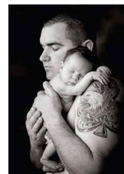
TINY TURNIP